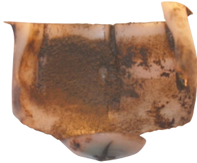
NOTE: Distressed OE style polymer bearing due to rough service conditions.