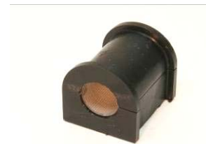
1 1/8" ID Teflon lined polyurethane pivot bushing