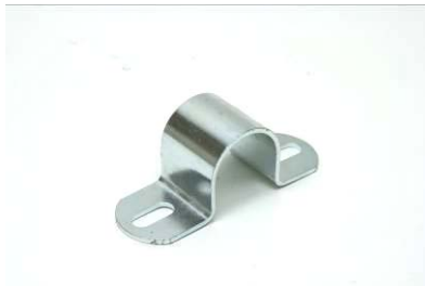
Zinc plated bushing bracket