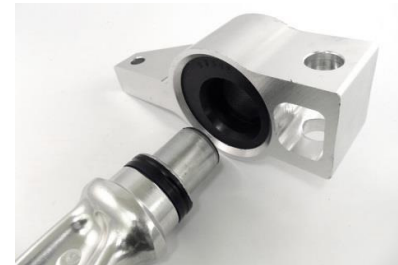
Note: bushing comes complete with housing left hand shown