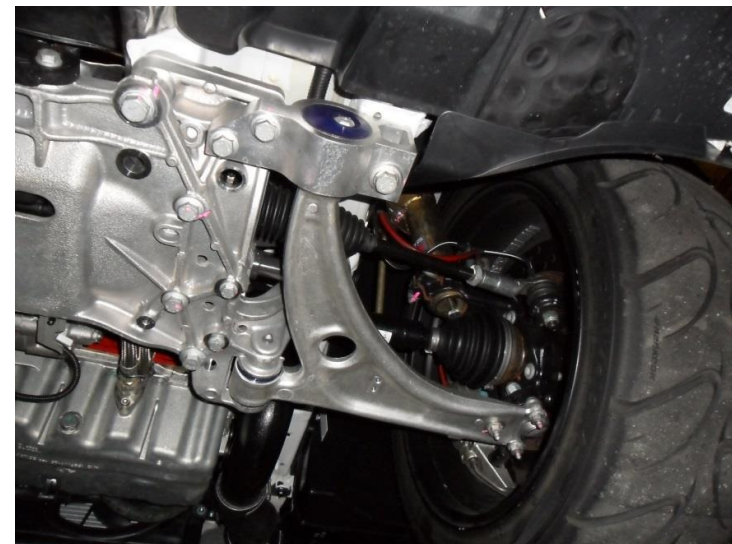
View of underside of car right hand side shown with arm assembly installed