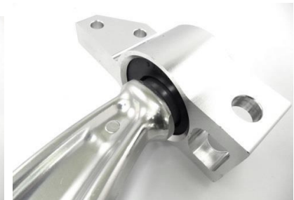
Lubricate bushing assembly